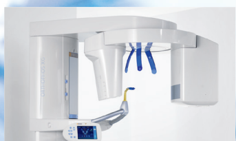
ORTHOPHOS XG 3D: Hybrid 2D/3D solution for all your imaging needs