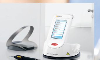
SIROLaser Advance: High-quality powerful laser for treatment and tissue management