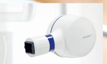
HELIODENT plus : Intraoral x-rays made easy