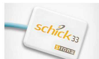
Schick 33: The most advanced imaging resolution in the industry