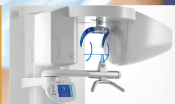
GALILEOS: The right 3D choice for every dentist providing diagnostic solutions

At Sirona, our broad range of compatible solutions is developed entirely around you. Every research study, every R & D investment and every new innovation is designed for one purpose: to help drive your success.