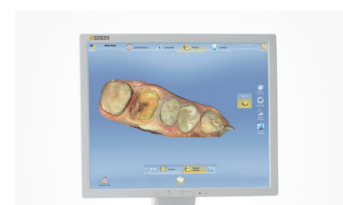
CEREC OmniCam: Providing dental restorations in just one session